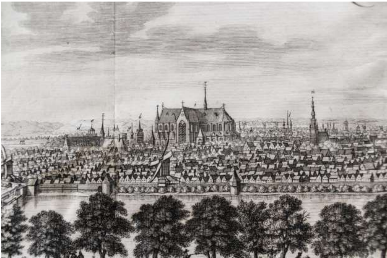
Engraving by Kaspar Merian from Martin Zieler's Topographia Germaniae Inferioris (c. 1660), 'View of Leyden' (Leiden)

In 1607 CE, the Anglican Church became aware of the Scrooby congregation and arrested some, placing others under surveillance, and fining those they could. The congregation, under the leadership of John Robinson (l. 1576-1628 CE) sold their belongings and relocated to Leiden, the Netherlands, where the government practiced a policy of religious tolerance.