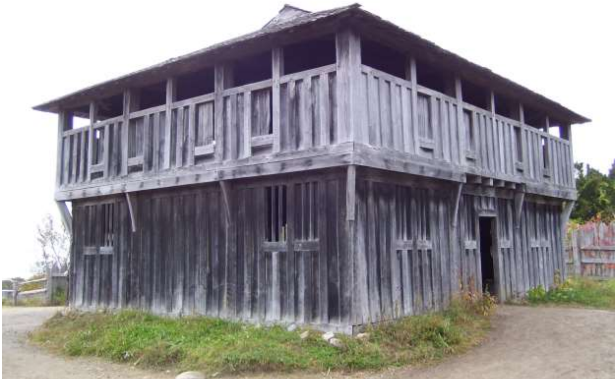
Recreated Fort/Meeting House at Plimoth Patuxet

Information here is from General Society of Mayflower Descendants; National Park Service; Bradford; Winslow; ColonialMeetingHouses-com)