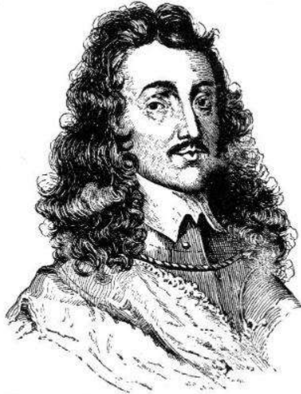
PORTRAIT OF GOVERNOR FRANCIS LOVELACE.

Colonists began pursuing settlements further inland as Boston became strained by a growing population. The towns of New England today owe their roots to the network of trails linking Boston to New York City.