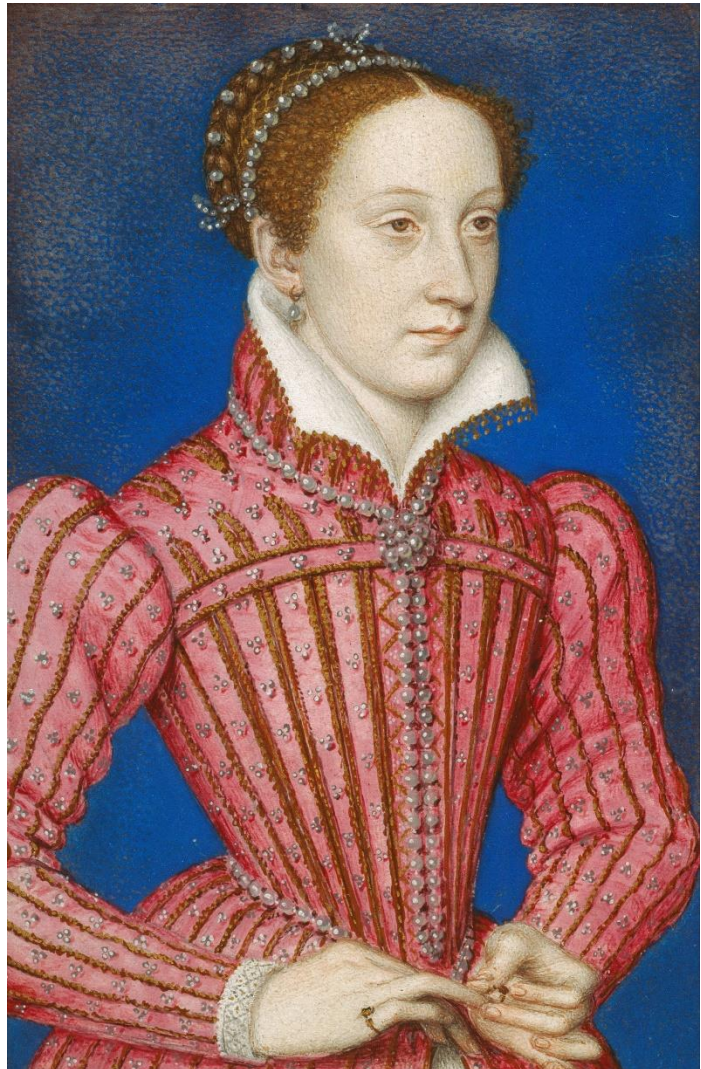
Mary Stuart (Mary, Queen of Scots)