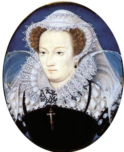
Mary, Queen of Scots

Paulet was understandably horrified, protesting that "God forbid that I should make so foul a shipwreck of my conscience."