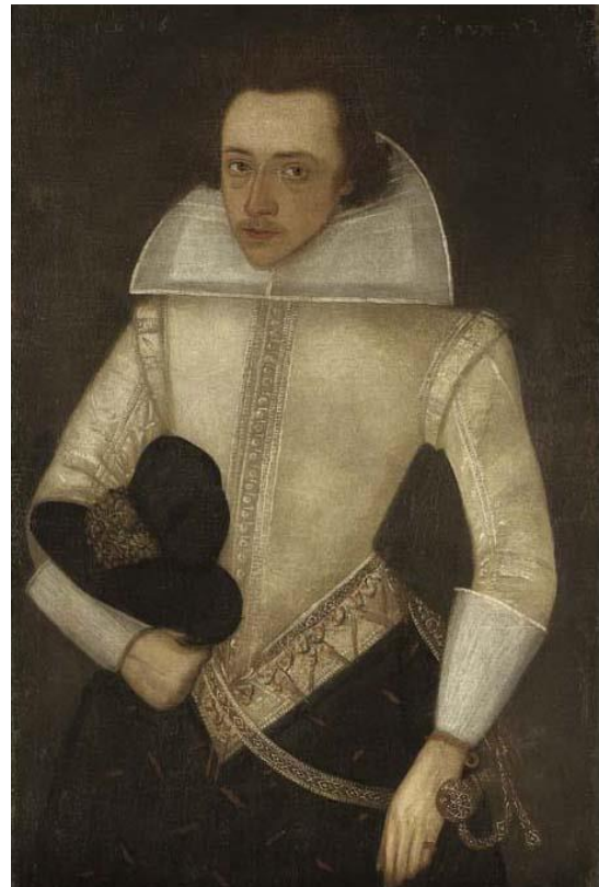
Portrait of young gentleman said to be Anthony Babington

On October 14, 1586, the trial of Mary, Queen of Scots, began at Fotheringay Castle in Northamptonshire.